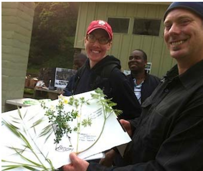
At Oakland's oldest Earth Day site Sausal Creek volunteers display common invasive plants to remove from the creek banks.

This publication is not produced at public expense.