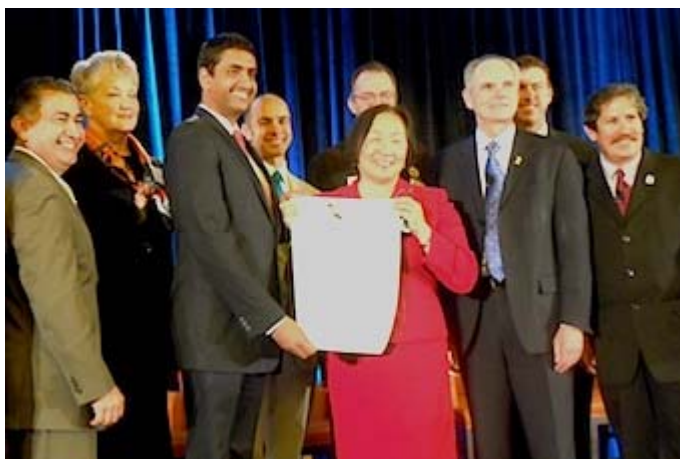
Northern California mayors hand Ro Khanna, Department of Commerce Deputy Assistant Secretary for the Foreign Service, our signed pledge for regional cooperation.

This week I also welcomed Federal Communications Commission Chair Julius Genachowski to the city to announce " Apps for Communities ," a national competition for creative applications that make public databases useful for the public. I would like to see an application that would let us use our phones to report status, building by building in case of a major fire or earthquake.