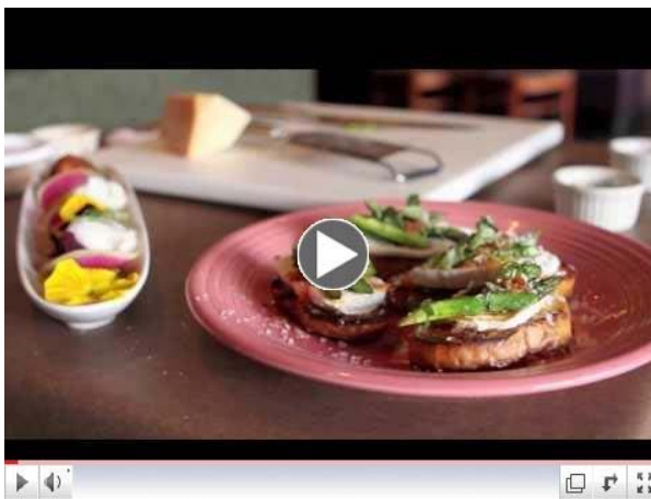
Montclair Restaurant Walk 2011 Invitation Rev 2

With easy access off of Highway 13 (Park Blvd. or Thornhill Drive exits), Montclair Village is known for its eclectic shops, great restaurants and walkable streets. Nestled in the beautiful, tree-covered Oakland Hills, Montclair Village has a laid back, small-town feel, plenty of parking in the City-owned garage, and over 200 retailers, service providers, restaurants, and financial service providers.