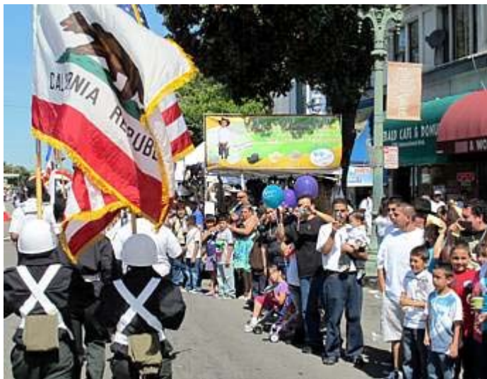
Cinco de Mayo in the Fruitvale Sunday started with an old fashion parade.

This publication is not produced at public expense.