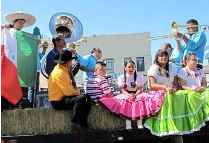
Vaqueros, floats, and mariachis and other bands join the parade.

We continue to celebrate Latino/Hispanic culture with a number of Cinco de Mayo events. This week the rotunda area outside of the Mayor's office will feature and exhibit by local Latino artists. Please join me there on Wednesday, May 4 from 5-6 pm to honor the artists: