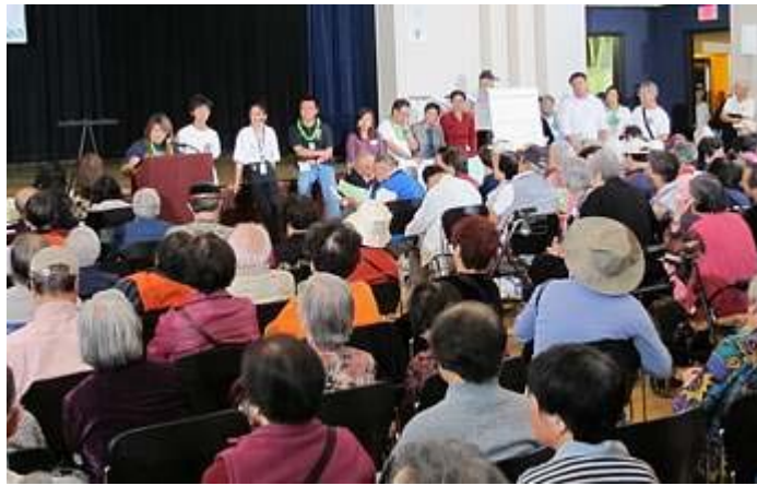
Small groups report out their priorities at Sunday's Chinese language Town Hall meeting.

This was our largest Town Hall meeting; the next closest was District 1 at 440. This brings the total number of participants in our Town Hall meetings to over 3000. For several months many volunteers from the City staff and community have been planning this effort; many thanks to the Chinese American Citizens Alliance, the Chinatown Chamber, the OACC, the Chinatown Library, the Chinese Citizen's Academy and the many senior groups that helped plan and mobilize for the event.