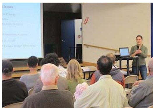
(Left) Students plea for programs at Peralta Hacienda at Thursday's Council hearing; (right) Budget