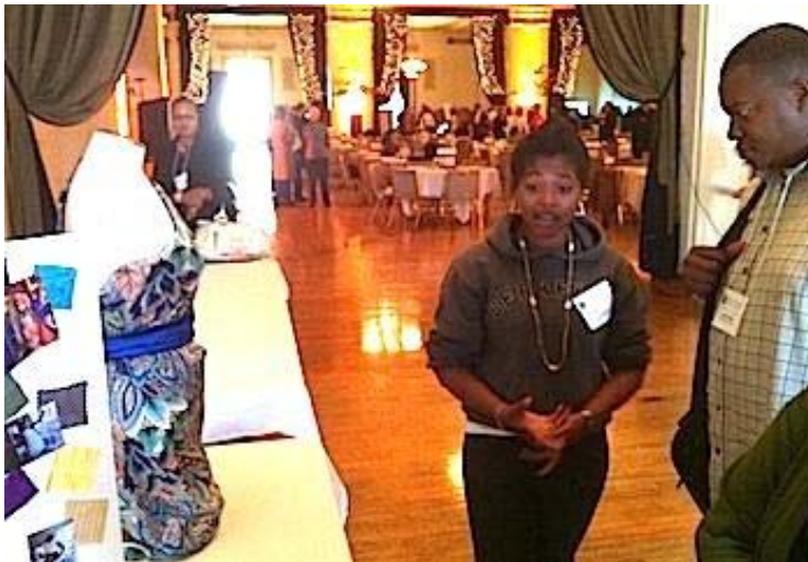
Student entrepreneur explains her fashion project at recent LinkedLearning, career pathway program.

THURSDAY: The City's Public Works Agency and Keep Oakland Beautiful will honor hundreds of volunteers who help maintain our parks, open spaces, medians, storm drains and remove graffiti through our Adopt-A-Spot program . Their work is so important and greatly appreciated in these hard economic times. If you are a Public Works volunteer please join us so I can personally thank you for your dedication at the Community Celebration, Thursday, 5 - 7 pm at the Lake Merritt Sailboat House.