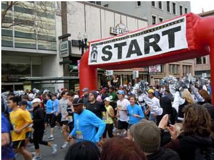
The Raiderettes cheer on the start of the half marathon.

This publication is not produced at public expense.