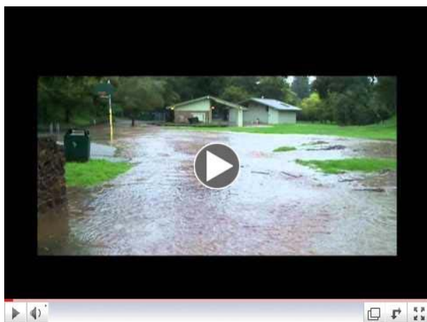
Great Flood of 2011

Last week's winter rains remind us to take care, especially if you live near one of our many creeks and their tributaries. See #6 for how you can help avoid floods while protecting our creeks and the bay. The city provides sand bags and plastic sheet at Fire Stations, the Public Works Corporation Yard at 7101 Hegenberger Road and the Shepherd Canyon Corporation Yard at 5921 Shepherd Canyon Road. Friday's storms were considered a "ten-year storm." The heavy rains caused Sausal Creek to overflow in Dimond Park. Watch Tim Chapman's video: