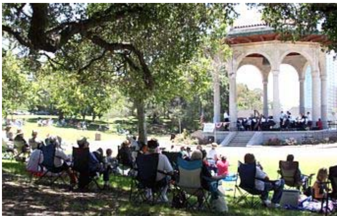
Perfect July 4th: Hundreds picnic under the oak trees on the shores of Lake Merritt for the July 4th Municipal Band concert.

JULY 4TH BANNER: Standing for the national anthem on the Lake Merritt Bandstand; descendents of Gov. George Pardee and others party in period dress for an old fashioned picnic at the historic Pardee House; Family Fair at Jack London Square (JLS); Mongolian dancers entertain at Chinatown's Lincoln Square; and a baby alpaca and friends at the JLS petting zoo.