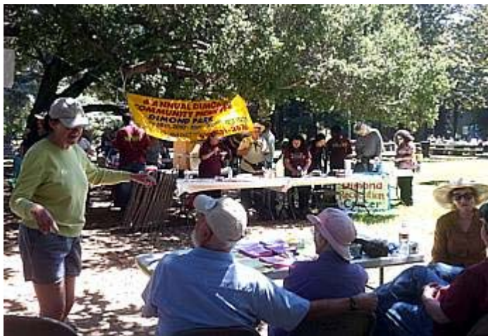
Dimond District Picnic last Sunday enjoyed Bella Circus and Woman's Will version of Shakespeare's A Mid Summer Night's Dream.

Council is on recess and I hope to get away for my first vacation in two years, but this also a busy time for us. We will spend much of this month working on city reorganization and other big projects identified in our Mayor's Staff Retreat this week. We will also be summarizing and prioritizing the opinions and discussion from the 8 Town Hall Meetings attended by over 3000 Oaklanders.