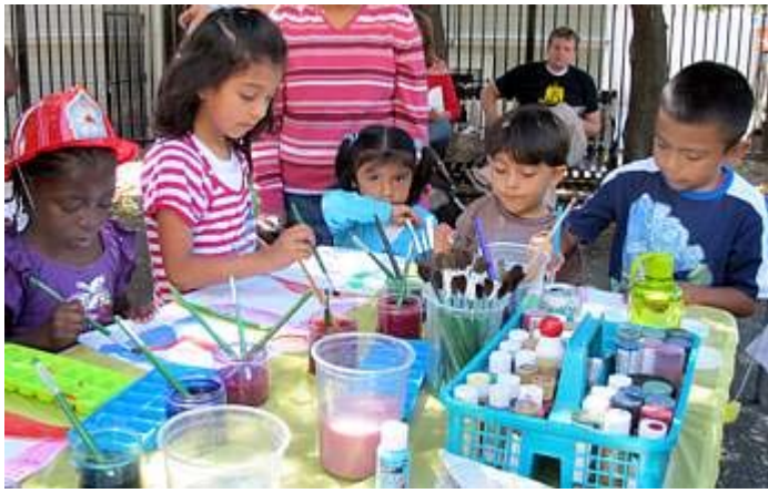
Painting quilt squares at the Melrose High Hopes block party.

Council is on recess and I hope to get away for my first vacation in two years, but this also a busy time for us. We will spend much of this month working on city reorganization and other big projects identified in our Mayor's Staff Retreat this week. We will also be summarizing and prioritizing the opinions and discussion from the 8 Town Hall Meetings attended by over 3000 Oaklanders.